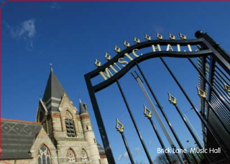
Brick Lane Music Hall